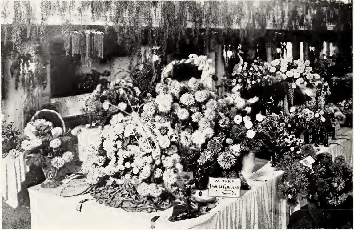
Another show that took twelve first prizes. Note the blue ribbons on the table.